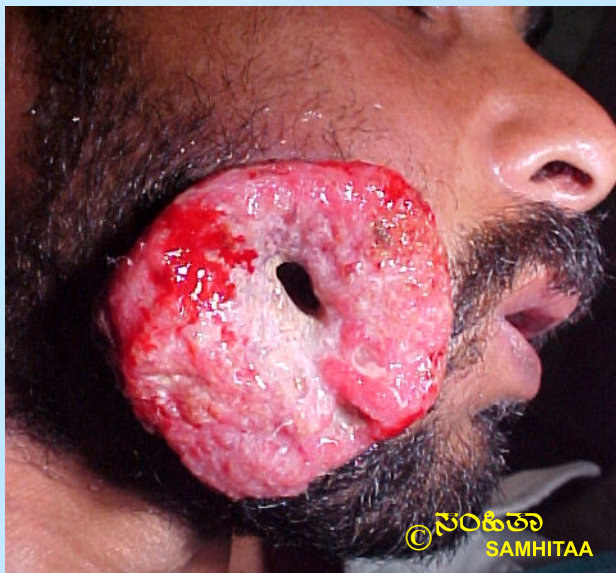
Cancer seen after using gutka for 8 years